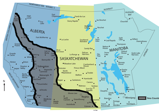
Colfax Imo® 8L Series Pumps in Western Canada The shaded area indicates where 350 Colfax Imo 8L series pumps are in use with various customers in Western Alberta. A major Canadian oil company uses 80 of the pumps.

In the early 1960s drilling and production for heavy crude oil was increasing rapidly in Northern Alberta. That meant the demand for small diameter (8" to 14") pipeline was also on the rise to meet the needs for moving the heavy oil to central blending facilities. The blended oil would then be more manageable for transportation across Canada and the United States in larger pipelines (usually 16" to 36").